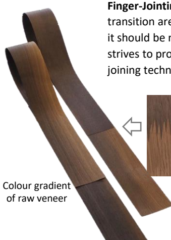
Colour gradient of raw veneer

Raw veneer: Smoked raw veneer naturally has a broad colour spectrum. This applies the entire width as well as the length. A marking, eye-catching colour is what makes it so attractive, especially on the surface and it's often desired.